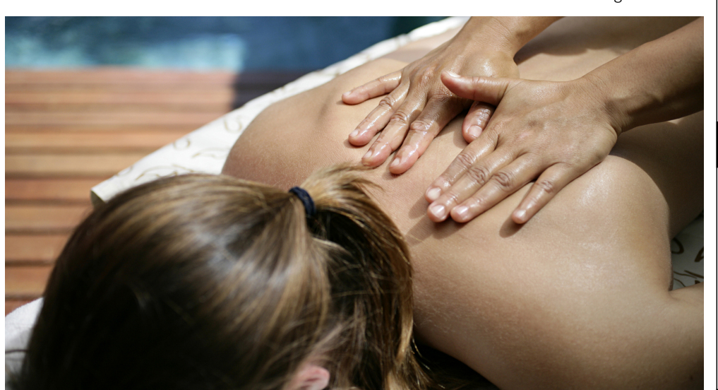
Massage helps you maintain a healthy body.

Massage is not just a luxury. It's a way of a healthier, happier life.